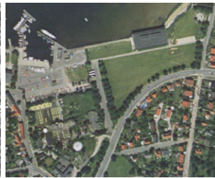
SITE IN 1995