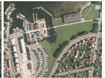
SITE IN 2012