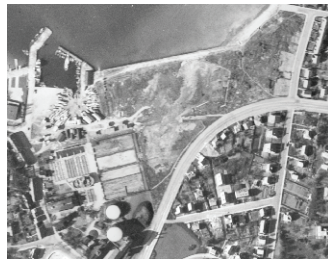
SITE IN 1954