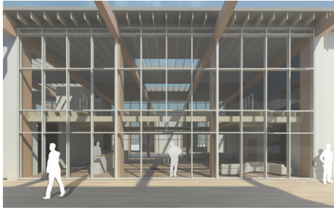
As you walk along the public path, the walls opens up in the form of curtain walls when you get to the foyer and ticket office to make a contrast that invites people in.