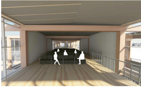
The auditorium on the first floor, absent of skylights to slightly darken the space for use of projector.