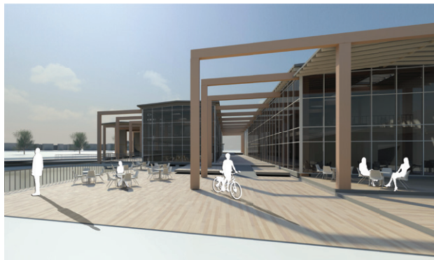
The space at the end of the public path provides visual connection between the island and the old museum, creating an extension of the cafe during summer and a space for various activities connected to either the paid or free part.