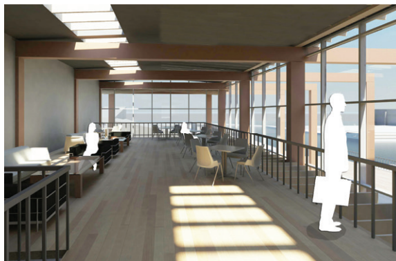
The first floor of the western building. A cafe and bookstore for tourists and locals alike, with a focus on Danish history and heritage.