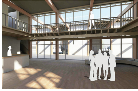
There are also curtain walls on the opposite side of the foyer so visitors can see through the building to "Havhingsten's" house on the opposite side. There are skylights in the foyer and the first floor is cut to make a light double high space to draw visitors in.