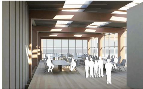
On the other side of the first floor is a space for lectures, introduction to the museum, ect. This space is full of skylights and curtain walls for adequate daylight in addition to a great view the vikingship museum and the surrounding areas.