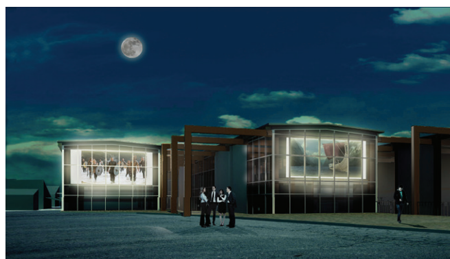
The facilities could be used outside normal operation times, for the benefit of the people of Roskilde. Here is an example of how a viewing would be visible from the outside and the road.