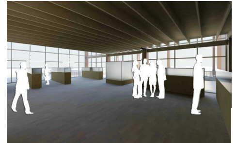
In the end of the building is an exhibition space used as an introduction to the vikingship museum and activities. From the room the guests can see the museum and a part of "Havhingsten" as a preview.