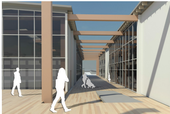
The public pathway leads straight from the parking lot to the museum island, and it is possible to use it without getting inside any of the facilities. However it is situated so that when used, visitors are exposed to both the building with "additional economic activities" (store, cafe and bookstore), and the museum activities (ticket office, intro exhibition, etc.)